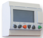
Digital PLC Controller Inside

Ecolo's AirPro ACU.18 is specially designed to provide programmable and continuous operation using any combination of remote air mist nozzle, vapor unit or spray station. ACU.18 is ideal in: